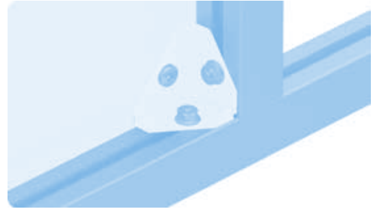
Stahlwinkel 45/60 Steel Connection Angle 45/60