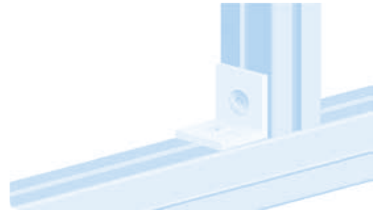
Stahlwinkel 30 Steel Connection Angle 30