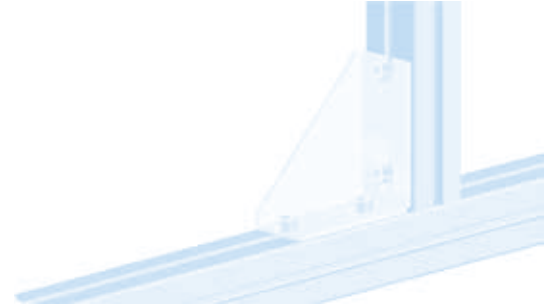
Stahlwinkel 45/100 Steel Connection Angle 45/100